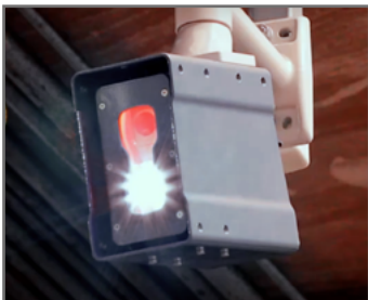
NUMBER PLATE RECOGNITION CAMERA